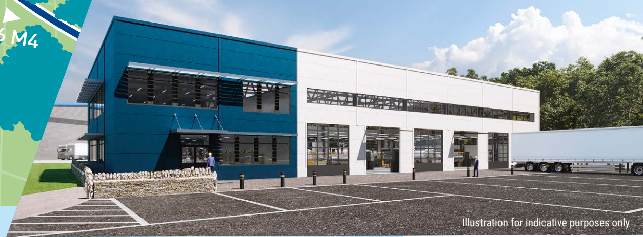
Illustration for indicative purposes only

Virtual Flight: To view drone footage, click here .