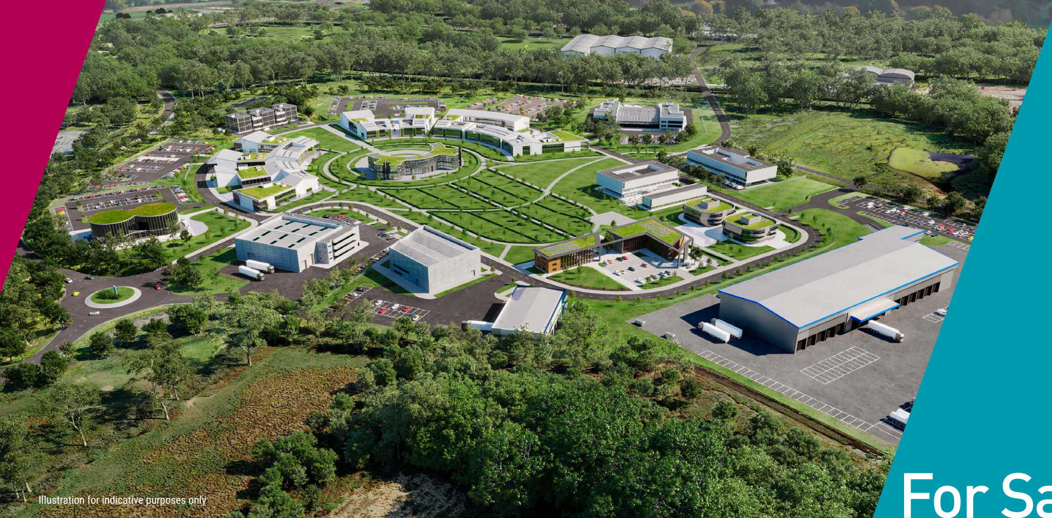
Illustration for indicative purposes only